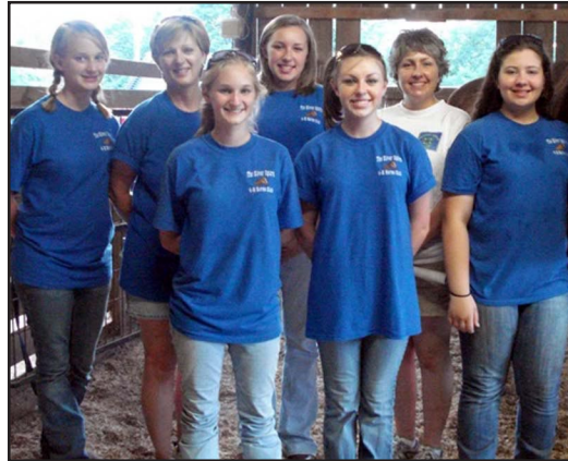
4-H volunteers work to help those at Special Equestrians.

It is amazing how people take so many things in life for granted. The program has affected the girl's outlook on everyday activities. They all have learned to appreciate their own health and not to take the small things in life for granted. "Getting on a personal level with someone with a disability can really change your whole perspective on life," one member said.